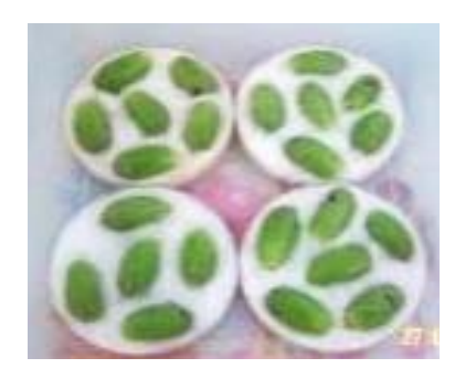
Fig 8: Acaricidal test

Dates were dipped in each concentration (1%, 2%, 3%, 4%, 5%) of the tested three plant extracts for 10 minutes, then left to dry. Each treatment was replicated five times for treated and control tests. Each concentration was sprayed on both the surfaces of dates using glass atomizer. The number of live spider mite was counted 24, 48 and 72 h until 10 days of treatment. Each treatment was replicated five times.