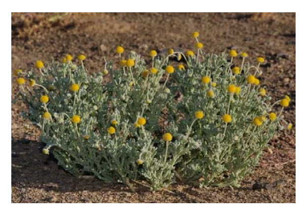
Fig 5: Cotula cinerea

Cotula cinerea (Fig. 5) is used in tea for its aroma, condiment and especially medicinally to aid digestion. It is popular for grazing, particularly for goats [6].