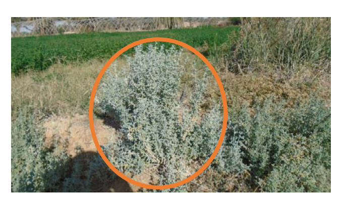
Fig 4: Zygophyllum album

Zygophyllum album (Fig 4) is used traditionally in Algeria for the treatment of different types of diseases such as skin diseases, its aqueous extracts are used in the treatment of diarrhea and diabets; Z. album is carminative, anti-septic and stimulant <sup>[5]</sup>.