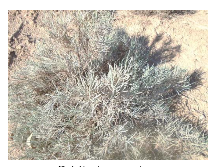
Fig 6: Limoniastrum guyonianum

infectious diseases or parasites that cause painful and bloody diarrhea [7].