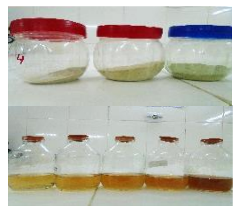
Fig 7: Aqueous plant extracts