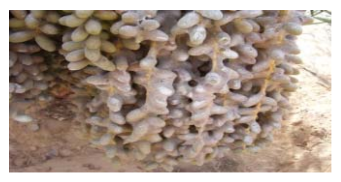
Fig 3: Regime attacked by mites

Date fruits of Deglet Noor variety were used to assess seasonal attacks of O. afrasiaticus . Samples were collected from attacked regimes by this mite (Fig 3). Immature date Fruits were placed in a Petri dish filled by cotton soaked. Water saturated cotton wool was used to prevent mite escape and maintained leaf freshness. The cotton wool was maintained wet by adding distillate water when necessary.