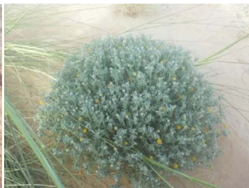
Cotula cinerea del.