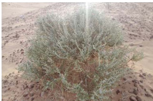
Salsola tetragona Del.