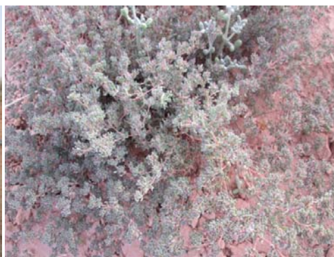
Fagonia glutinosa Delile.