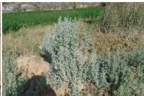
Zygophyllum album L.