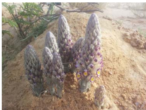
Cistanche tinctoria (forsk.) Beck.

inhalation, ointment, herb tea) and administered through various routes (oral, dermal, nasal and other body parts). However, plant part (s) and homogenizing it in water are the commonly used form of herbal preparation for both human. The oral administration which regrouped the major form of usage, which was in form of drink, was most exercised.