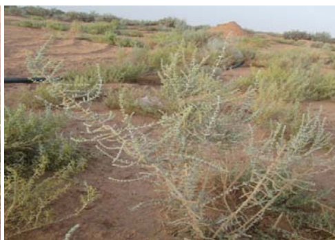
Halocnemum strobilaceum (pall)