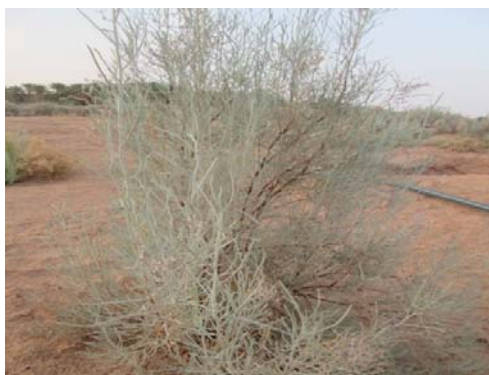
Limoniastrum guyonianum Coss & Dur.