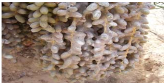
Fig 3: Regime attacked by mites

Date fruits of Deglet Noor variety were used to assess seasonal attacks of O. afrasiaticus . Samples were collected from attacked regimes by this mite (Fig 3). Immature date Fruits were placed in a Petri dish filled by cotton soaked. Water saturated cotton wool was used to prevent mite escape and maintained leaf freshness. The cotton wool was maintained wet by adding distillate water when necessary.