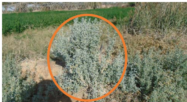
Fig 4: Zygophyllum album

Zygophyllum album (Fig 4) is used traditionally in Algeria for the treatment of different types of diseases such as skin diseases, its aqueous extracts are used in the treatment of diarrhea and diabetes; Z. album is carminative, anti-septic and stimulant [5].