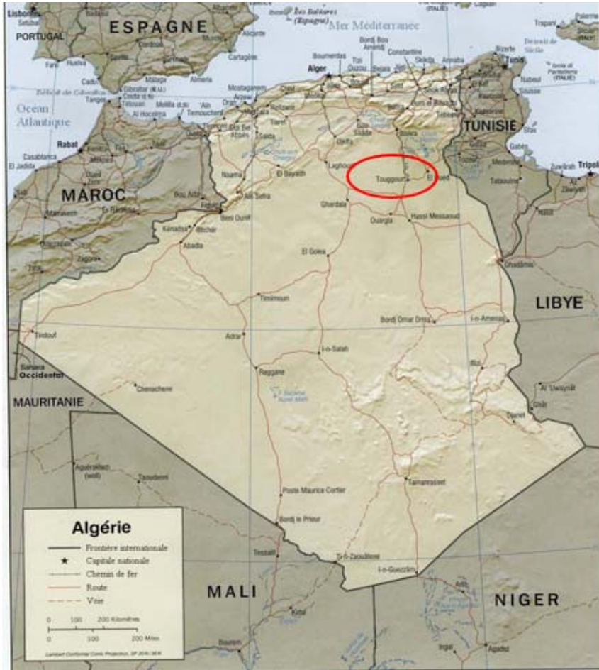
Fig 1: Study site