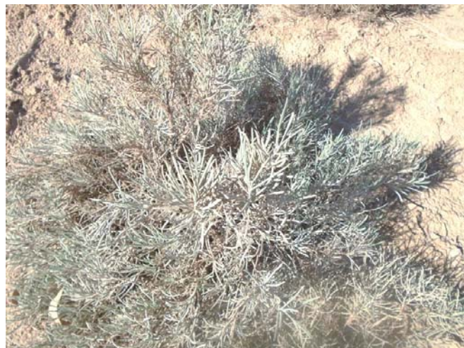
Fig 6: Limoniastrum guyonianum

infectious diseases or parasites that cause painful and bloody diarrhea [7].