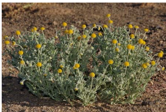
Fig 5: Cotula cinerea

Cotula cinerea (Fig. 5) is used in tea for its aroma, condiment and especially medicinally to aid digestion. It is popular for grazing, particularly for goats [6].