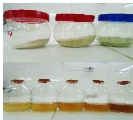
Fig 7: Aqueous plant extracts