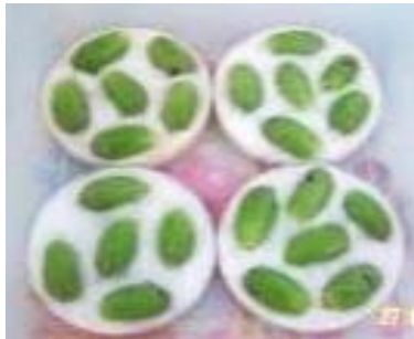
Fig 8: Acaricidal test

Dates were dipped in each concentration (1%, 2%, 3%, 4%, 5%) of the tested three plant extracts for 10 minutes, then left to dry. Each treatment was replicated five times for treated and control tests. Each concentration was sprayed on both the surfaces of dates using glass atomizer. The number of live spider mite was counted 24, 48 and 72 h until 10 days of treatment. Each treatment was replicated five times.